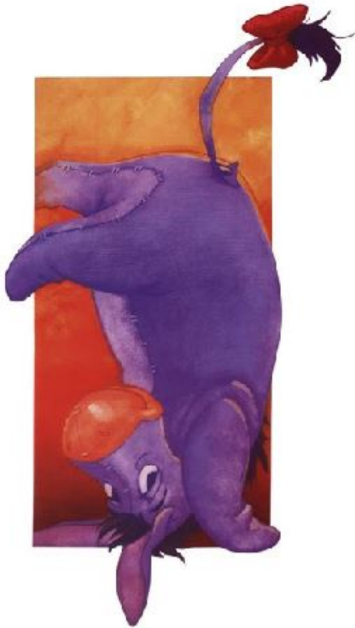
E e y o r e

©1991 Disney. All Rights Reserved. Winnie the Pooh, Eeyore, and the characters are trademarks of Disney. Eeyore is a registered trademark of Disney. All other trademarks are the property of their respective owners.